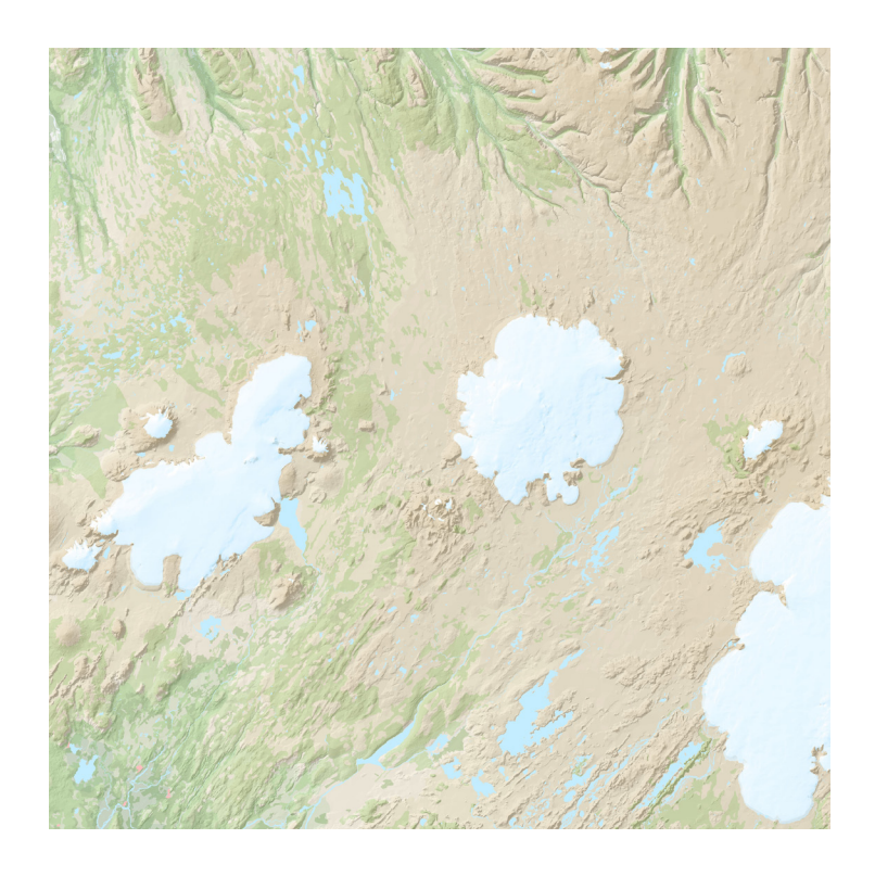
Geographical information about Iceland

The role of the National Land Survey of Iceland is to ensure that basic geographical information about Iceland is always available.