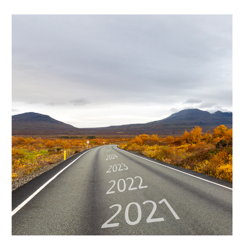
Spatial information for decision making

Reliable public spatial information will be used as key data in decision making.